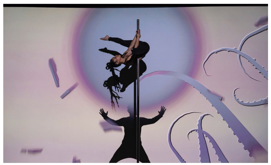
Animal Intelligence

Post Theater works in theater and media art. Thematic focus is the relationship of human beings and technology. More than 60 performances have been presented in 50 cities / 20 countries, often commissioned by international festivals (e.g. Singapore Arts Fest., Tanz im August, Varna Summer).