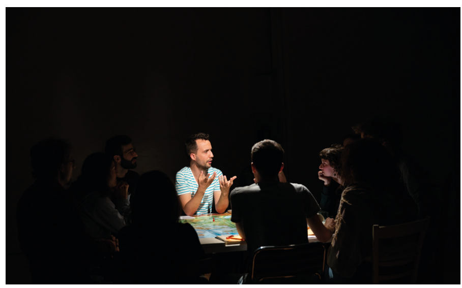
On the first night we looked at maps

Vöcks de Schwindt are an Argentinian-German directing duo. Their works range from autobiographically motivated performances to multilingual drama productions and music theatre. They are exploring questions of migrant identities, queer heritage, male tenderness and the role of rituals in our present days.