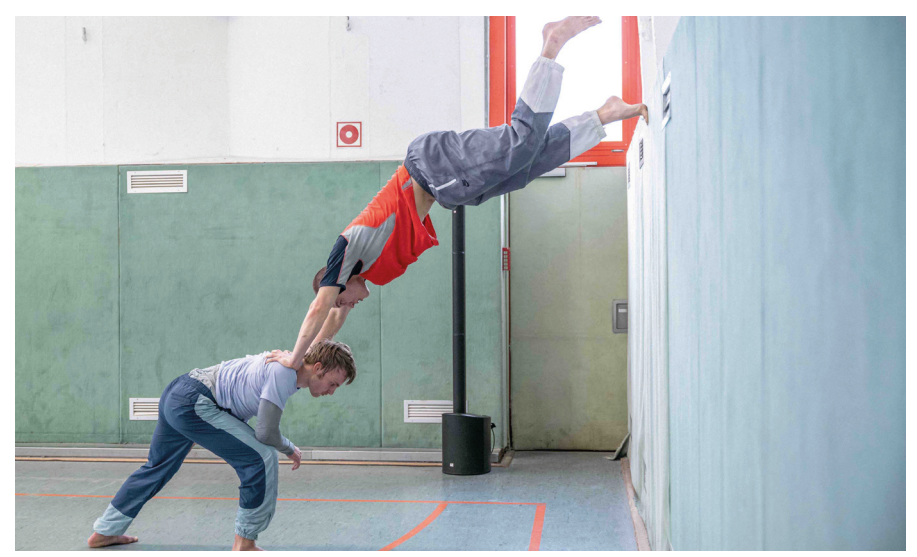
Where the Boys Are

Yotam Peled & the Free Radicals is an independent, interdisciplinary group, addressing topics of gender and community rituals. The work centers around the potential of movement to transform social codes, employing a vocabulary rooted in contemporary dance, martial arts and circus.