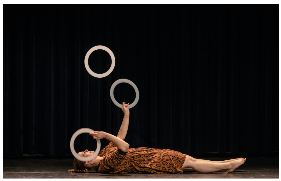
i was told