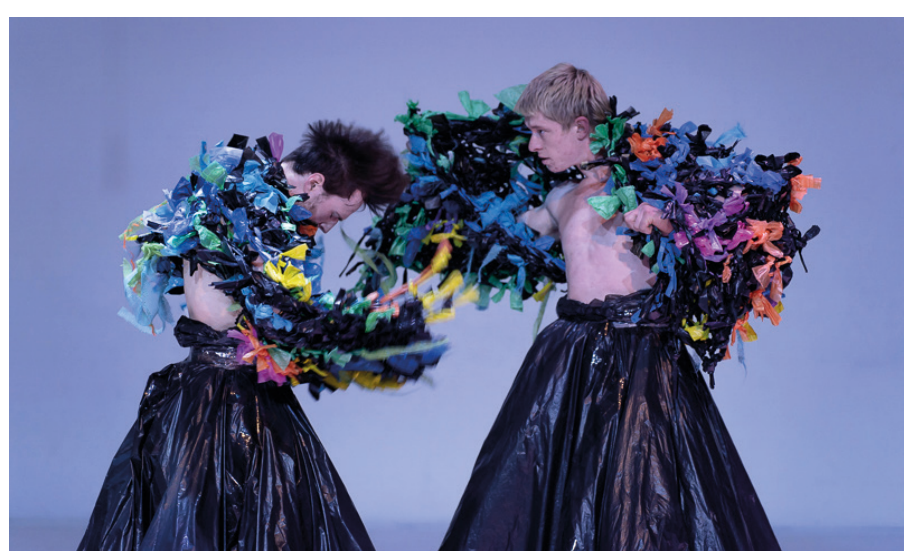
BIRD OF PARADISE © Giovanni Lo Curto

LUNA PARK connects contemporary dance production with artistic education for young people, bridging professionals and amateurs. Their projects foster artistic encounters through performances and community engagement.