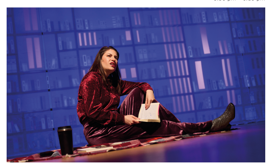
Faserland Boys