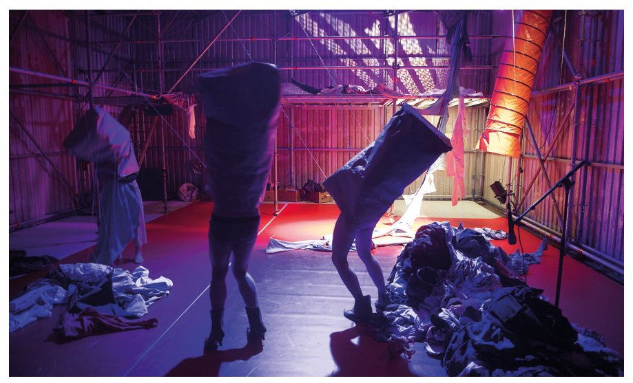
street fabrik © Dieter Hartwig

The performance collective die elektroschuhe explores socio-political issues through spatial experimentation in public, private, and stage spaces. Since 2019, they have collaborated with ZUsammenKUNFT at Haus der Statistik on sustainability-focused projects.