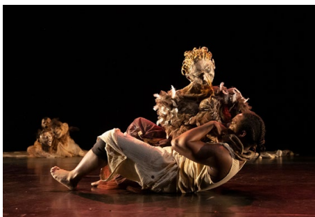
FIGURE IT OUT alternates each year between Berlin, Leipzig and Stuttgart and presents the diversity of contemporary puppet and object theater. The showcase offers a platform for artistic experiments with puppets, objects, materials, avatars and masks. The schedule of programming is supplemented by showings, tryouts and interactive encounters between the audience and the artists. The next Berlin edition in September 2026 at Schaubude Berlin will present productions that look for inclusive forms of expression and that integrate the tools of accessibility in their aesthetic.

→ Contemporary Puppet & Object Theater Annually. Next Berlin edition: Sept. 10–13, 2026. The Berlin edition is presented by Schaubude Berlin. ↗ schaubude.berlin/en/program/figure-it-out/